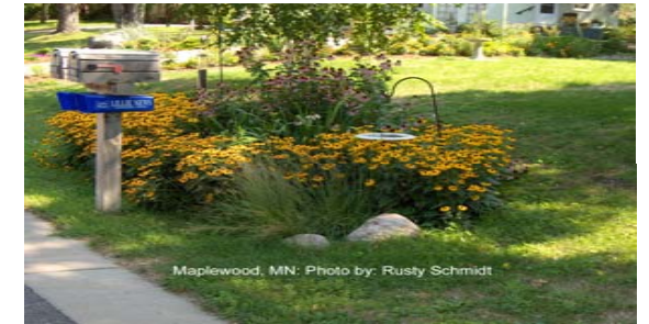
Maplewood, MN: Photo by: Rusty Schmidt

and reproduction. Most of the plants in our zone's rain garden list prefer sun to partial shade and average to moist soil conditions.