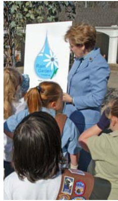
Rep. Kaptur and Girl Scouts at Wildwood Metropark

In the summer of 2006, citizens in Toledo and Lucas County sustained heavy flooding from a series of rainstorms. The rainwater from these storms exceeded the capacity of the ditches and storm sewers. In urban areas like Toledo, the volume of storm water is increased due to the enormous amount of impervious surfaces, including parking lots, roads, and buildings. A rain garden is one way to manage this stormwater.