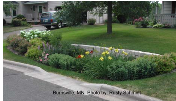
Burnsville, MN: Photo by: Rusty Schmidt

(hole drains 1-1/2 inches in 4 hours) X 6 = 9 inches: → your garden can be up to 9 inches deep