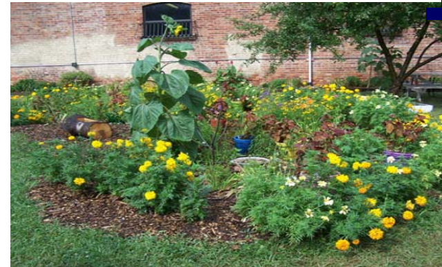
Sofia Quintero Arts & Cultural Center Rain Garden