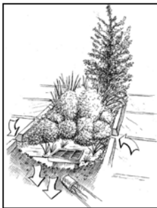
How a Rain garden functions. Illustration by Rusty Schmidt

A rain garden is a low area that catches and slows storm water from downspouts, driveways, parking lots and roads allowing it to infiltrate into the soil with the help of deep-rooted plants, usually native forbs and grasses. The garden is planted in a shallow basin by a home or business and can filter pollutants from the stormwater that it captures and absorbs.