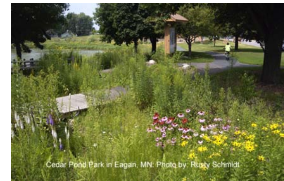
Cedar Pond Park in Eagan, MN.

Promoting Natural Stormwater Management and Urban Beautification