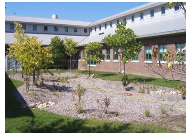
City of Toledo Division of Environmental Services demonstration rain garden